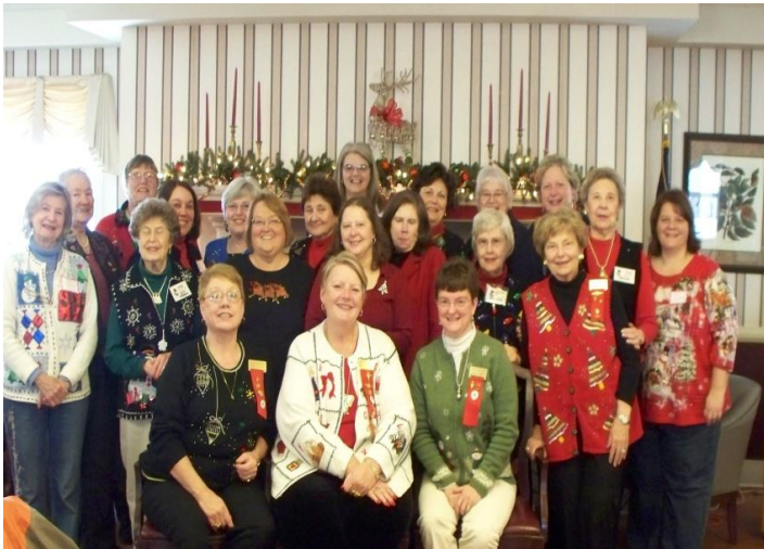
Alpha Chapter December 10, 2011

For more photos, go to www.AlphaChapterDKG